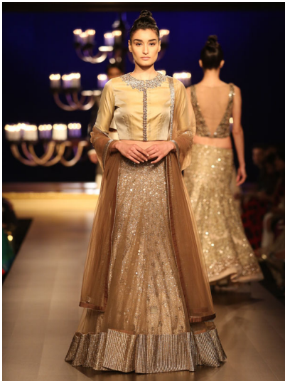
06/08/2014 12:44 pm The model is wearing a long, shimmering, light-colored gown with a sheer, ruffled skirt and a matching long-sleeved top. The gown is heavily embellished with sequins and beads, giving it a luxurious appearance. The model is walking on a runway, and the background is dark with some lighting fixtures visible.

&bull;Written by amit bachchan&bull; &bull;&bull;Tuesday&bull;, 22 &bull;July&bull;, 2014 04:17&bull; -