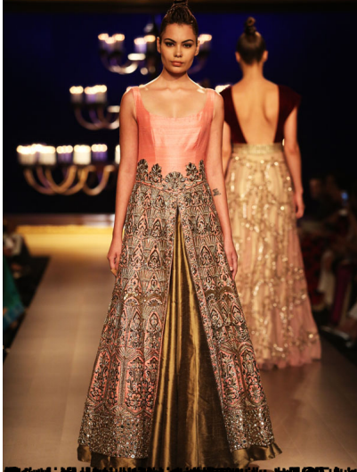
06/08/2014 12:44 pm The model is wearing a long, shimmering, light-colored gown with a sheer, ruffled skirt and a matching long-sleeved top. The gown is heavily embellished with sequins and beads, giving it a luxurious appearance. The model is walking on a runway, and the background is dark with some lighting fixtures visible.